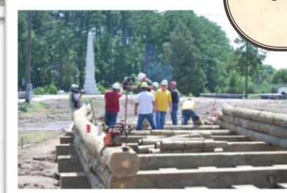
Pictured on the right is the construction of the historic causeway. The causeway is constructed of interlocking beams, as shown above.