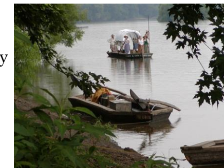
The Lady Slipper batteau, which sunk shortly after this photo was taken, is an example of the type of boat that will be present at our Waterways Heritage Festival.

Our Waterways Heritage Festival Committee has been working hard to plan an event which showcases the vast amount of talent found locally. Enjoy two days of cultural heritage, fine arts, and music. Visit the many guilds and learn firsthand how things are made! Exhibitors and vendors will display and sell their unique crafts ranging from: weaving, woodworking, basket-making, pottery, quilters, master gardeners, photographers, silversmith jewelry artistry, glass blowers, sheep-shearing, and more. Additionally, we are excited to announce that this year that there will be a Batteau visiting our Waterways Heritage Festival!